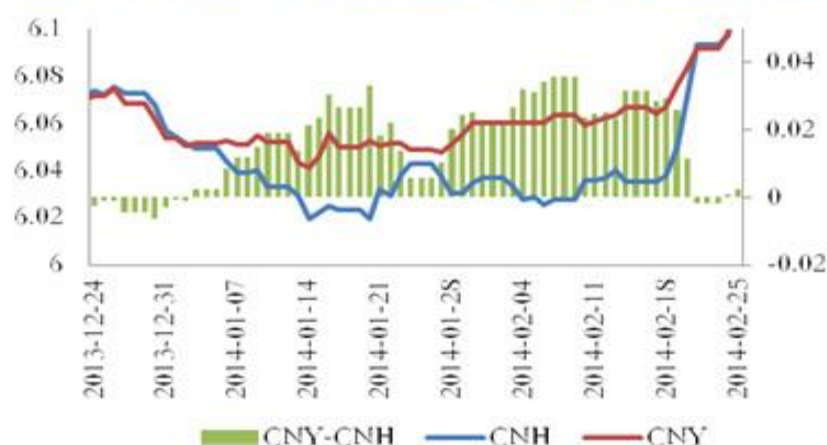
圖 1: 美元兌人民幣在岸匯率 (CNY) 與離岸匯率 (CNH) 走勢

情況從 2 月下旬開始發生根本性變化。2 月 21 日，離岸人民幣匯率今年以來首次跌至在岸人民幣匯率之下。2 月 25 日，人民幣即期匯率近一年多來首次跌至中間價之下。這意味著，在央行持續通過“量”“價”引導的影響下，市場的預期已經開始發生方向性變化。前期國內由於人民幣升值過快而壓抑的購匯需求開始集中釋放，境外熱錢也開始集中獲利了結，由此引發人民幣暴跌。