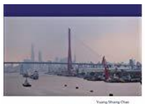
MNE Investment Strategy and Risk Evaluated in China The Joint Effects of MNE's Overallication Strategy on Parlamence and Systematic Role Evaluation on China Strategy and Systematic Role Evaluation of China

https://www.amazon.com/Yuang-Shiang-Chao/e/B00IV30N1E MNE Investment Strategy and Risk Evaluated in China: The Joint Effects of MNE's Diversification Strategy on Performance and Systematic Risk Evaluated in China Investment by Yuang Shiang Chao Paperback $92.71