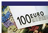
What Government Bonds and Investors Matter in Global Financial Crisis? Evidence and Strategic Thinking