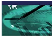
Global Value Chains and Regional Economic Integration Development