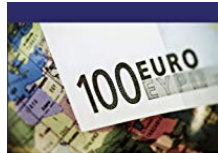
What Government Bonds and Investors Matter in Global Financial Crisis? Evidence and Strategic Thinking