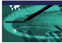
Global Value Chains and Regional Economic Integration Development

I'm a college teacher who teaches for more than 20 years in university since 1999. I enjoy myself in doing research and teaching in my academic life. I have taught for over twenty years in University since 1999. Most of my students work in financial institutions, insurance companies, stock markets and financial department in good companies. In the meanwhile, I also acted as a financial/strategic consultant in four medium-sized enterprises since March, 2009. I expect that there are two main academic directions to do subsequent research in the future. In addition, I'm also a Buddhist and was converted to