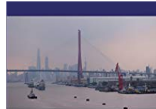
MNE Investment Strategy and Risk Evaluated in China The Joint Effects of MNE's Diversification Strategy on Performance and Systemic Risk Evaluated in China Investment